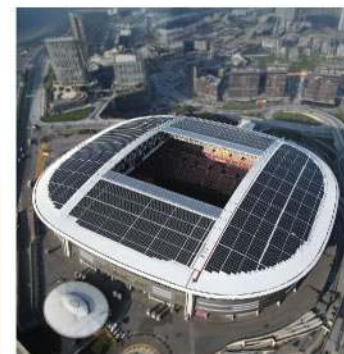
ROOF-TOP MOUNTING SYSTEMS