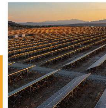
FIXED-TILT GROUND MOUNTING SYSTEMS