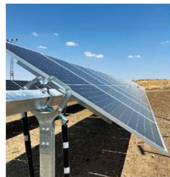
OEM PRODUCTIONS FOR THE SOLAR TRACKER BRANDS