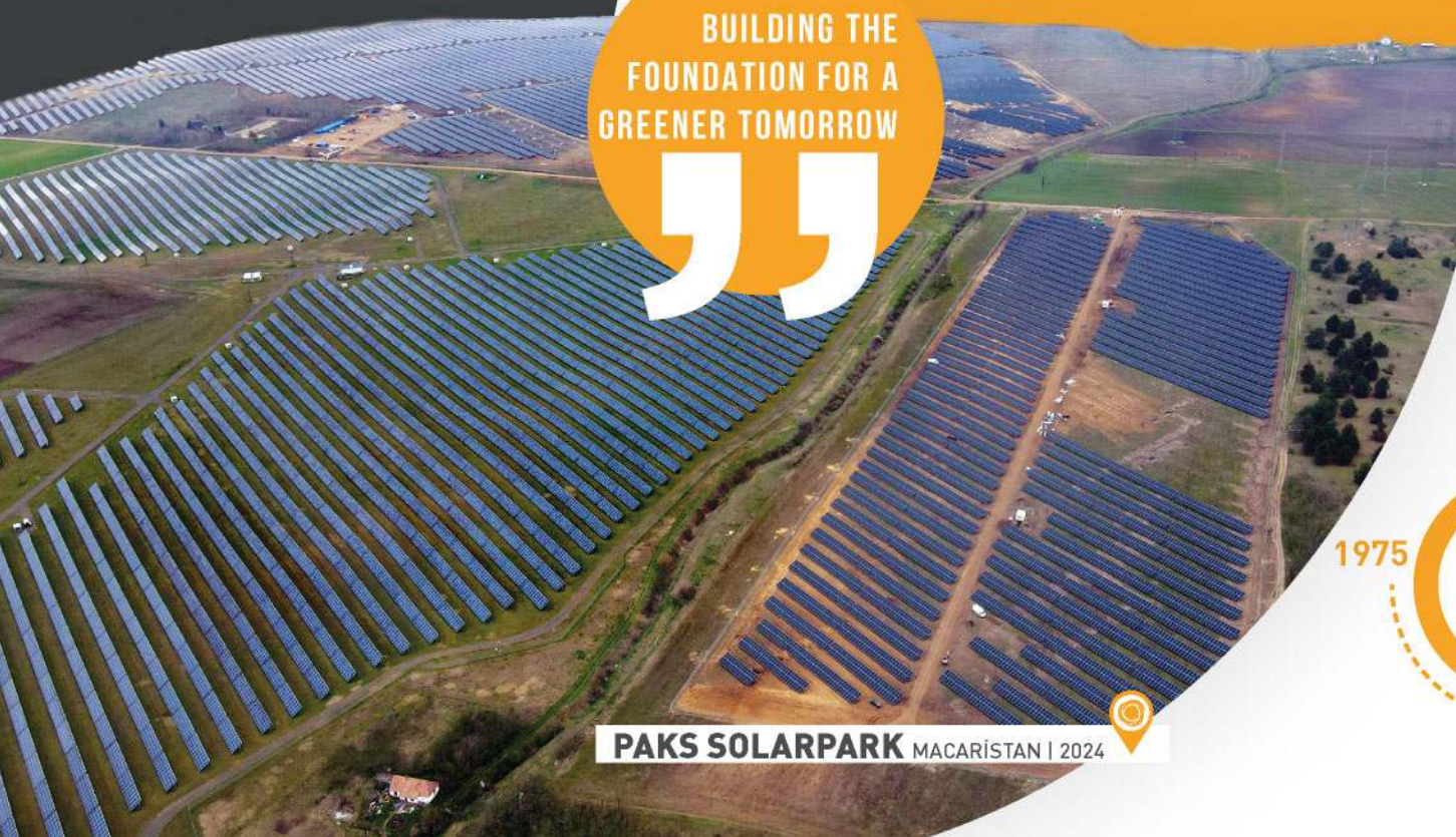
PAKS SOLARPARK MACARİSTAN | 2024