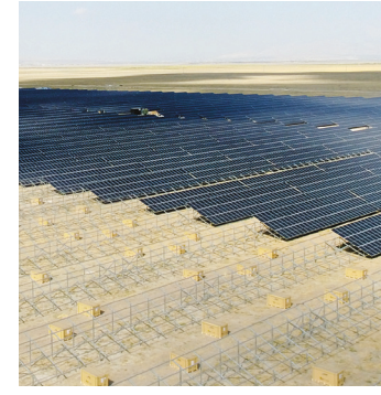
FIXED-TILT GROUND MOUNTING SYSTEMS

OUR EXPERTISE WILL CARRY YOUR PROJECTS ONWARD