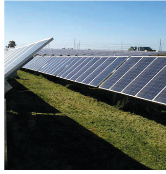
OEM PRODUCTIONS FOR THE SOLAR TRACKER BRANDS